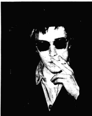
Johnny Rotten . . . totally enamoured by the Jamaican culture.