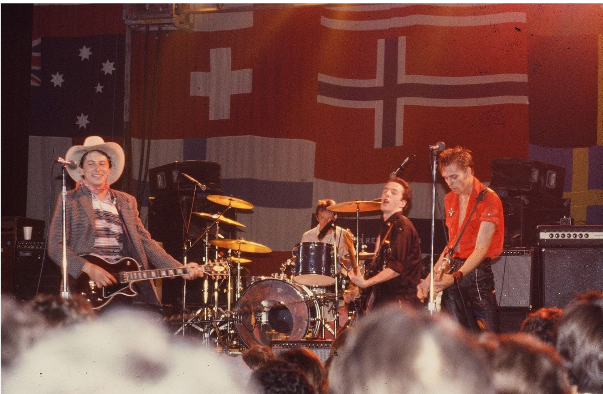
Ely joins the Clash at the Armadillo in 1979.

Someone described this show in Oct. '79 as Joe Ely and his band pouring gasoline all over the stage and then the Clash coming out and lighting a match. "There was such an explosive feeling in the air," said Ely. "I felt it. The Clash felt it. They had been disappointed with some of their first shows in the States, because some of the crowds were hostile and confrontational." The Clash's "I'm So Bored with the U.S.A." apparently rubbed a few lunkheads the wrong way. But the Dillo crowd was ready for a great rock and roll show and the Clash, Ely and opening band the Skunks gave it to them. Then everyone crammed into the Continental Club and jammed all night.