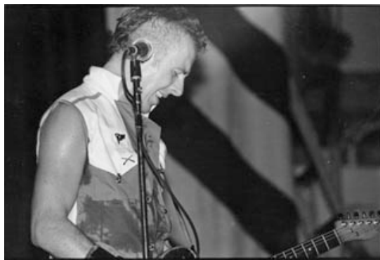
Rock the Coliseum: Strummer

The most impressive surprise about the night was how strongly the band played. So much of punk is based on nonmusical assaults that watching this quartet work its muscular magic was nothing short of mind-bending. Then, just about the time it seemed like there was absolutely no way for the quartet to top itself, they pulled out brand-new songs like "London Calling," "Wrong 'Em Boyo," and "Clampdown" with a dazzling swagger to suggest we hadn't seen nothing yet.