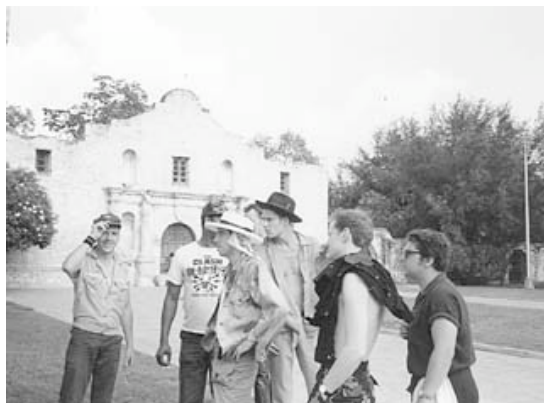
City of the Dead: the Clash at the Alamo, 1979

I use the pre-dawn hours to drink coffee, get caught up on cable news, and generally jump-start my nervous system. Two days before Christmas, a God-awful storm was beating Austin, and as I tried getting my brain in focus, I glanced up and saw the Fox News crawl move across the bottom of my TV screen, "Punk Singer Joe Strummer Dead at 50." Surely that couldn't be right; I waited 10 minutes for the headline to cycle back through again, and when it did, I sent off an early-morning e-mail that read, " Joe Strummer Dead ," not knowing what else to say. I spent the whole wretched day wondering how in the hell it could be.