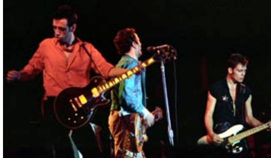
Jones, Strummer, and Simonon at the Armadillo

"We said, 'Well, if you ever get over across the ocean, look us up. We'll take you to some good places in Texas.' They were really fascinated with Texas, and especially towns with names like Laredo, El Paso, San Antonio. To them, Texas was a mythical place that they only knew about in old Marty Robbins gunfighter ballads and Westerns and stuff.