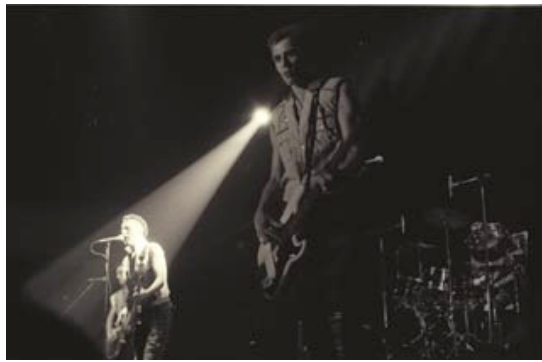
Mr. Smarty Pants' Clash Chronicle cover from 1981