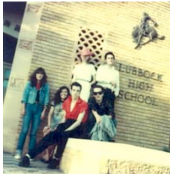
Jones and Strummer (front center) at "Buddy Holly High."