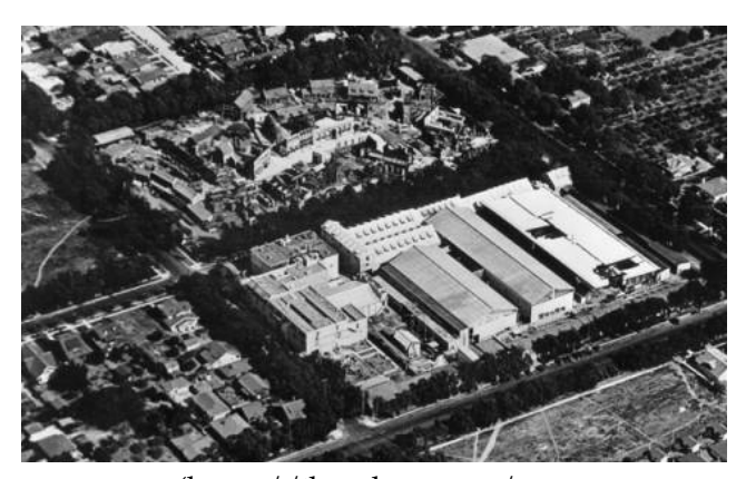
(https://jhgraham.com/wpcontent/uploads/2020/11/lasky_studios_aerial_view-1.jpg) Famous Players-Lasky c. 1919.

The narrow parcel, bounded by Argyle Avenue, El Centro Avenue, Sunset Boulevard and Selma Avenue, had been the back lot for Famous Players-Lasky studios, whose films were released through the Paramount Pictures Corp. (Famous Players-Lasky also owned the parcel next door between Vine and Argyle where its main studio buildings and offices were located). In 1926 Paramount-Famous-Lasky moved to new quarters at 5451 Marathon St. Paramount still maintained a film storage building at the northwest corner of Selma and Argyle (1546 Argyle) but otherwise the Sunset property was more or less vacant.