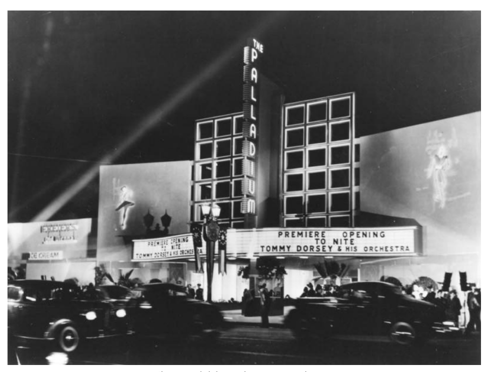
(https://jhgraham.com/wp-content/uploads/2020/11/tommy_dorsey_at_palladium.jpg) Opening night of the Hollywood Palladium with Tommy Dorsey, 10/31/40.