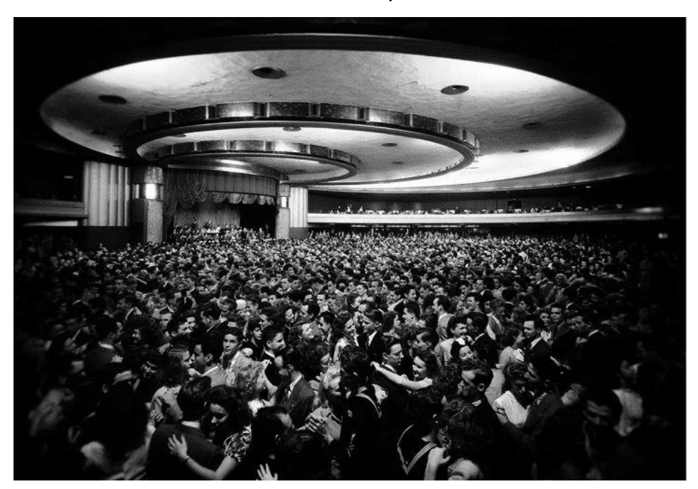
(https://jhgraham.com/wp-content/uploads/2020/11/palladium2.jpg) The ultra-modernistic interior. LAPL.