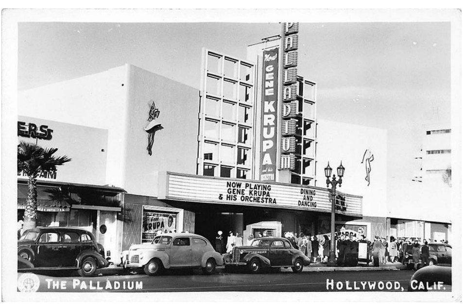
(https://jhgraham.com/wp-content/uploads/2020/11/palladium.jpg) Gene Krupa made his Hollywood Palladium debut in September 1941.