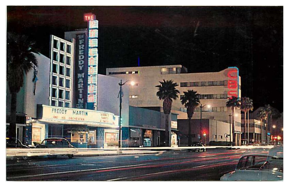
(https://jhgraham.com/wp-content/uploads/2020/11/freddy-martin.jpg) Freddy Martin c. 1950.