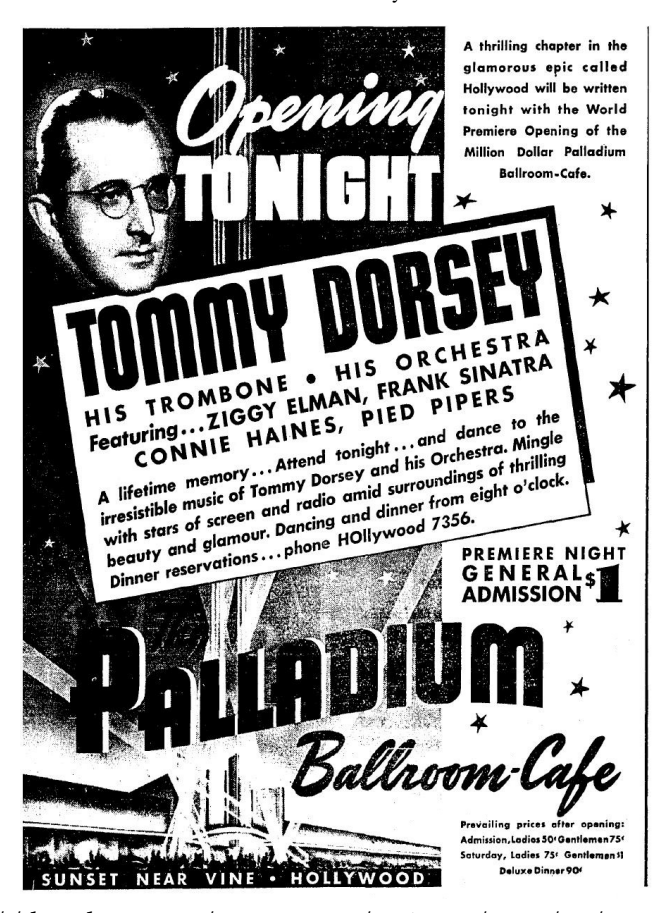
(https://jhgraham.com/wp-content/uploads/2020/11/10-31-40.jpg) 10/31/1940. LAT