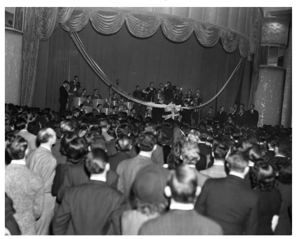
(https://jhgraham.com/wp-content/uploads/2020/11/tommy_dorsey_band_at_the_palladium.jpg) The ceremonial ribbon-cutting was performed by Tommy Dorsey and Dorothy Lamour. LAPL.