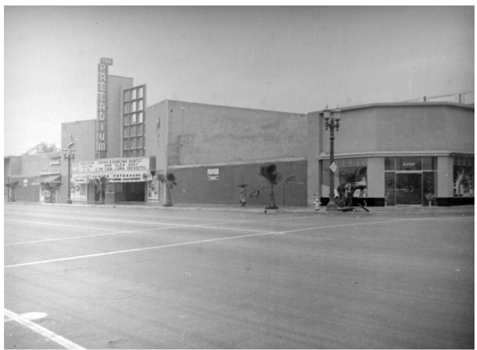
(https://jhgraham.com/wp-content/uploads/2020/11/00102050.jpg) View of the Palladium from El Centro Avenue showing the large corner storefront. In January 1941 it became a flight terminal for TWA, addressed as 6201 Sunset. Passengers from Hollywood or Beverly Hills could obtain tickets and weigh their baggage here, eliminating the need to check in at the airport. Limousine service was also provided. LAPL.