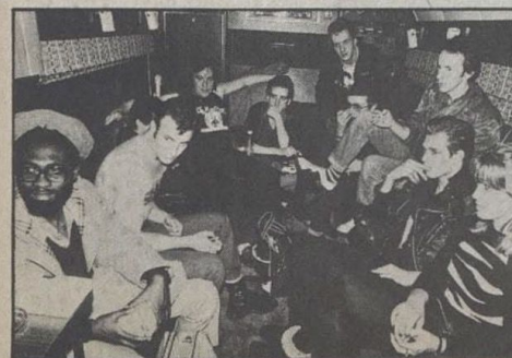
Boys in the band, crew, and friends on the tour bus.