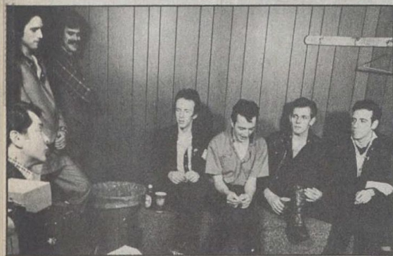
Always helpful, the band takes time out backstage at the Palladium in NYC to do a TV interview.