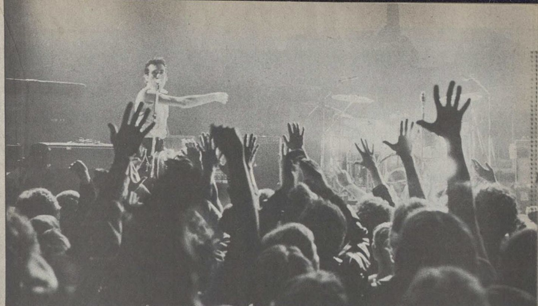
At the Palladium in NYC, nobody had time to sit down during the entire Clash show.