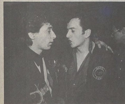
Johnny Thunders and Joe Strummer consider the serious side of rock as existential lifestyle in the Palladium dressing room.