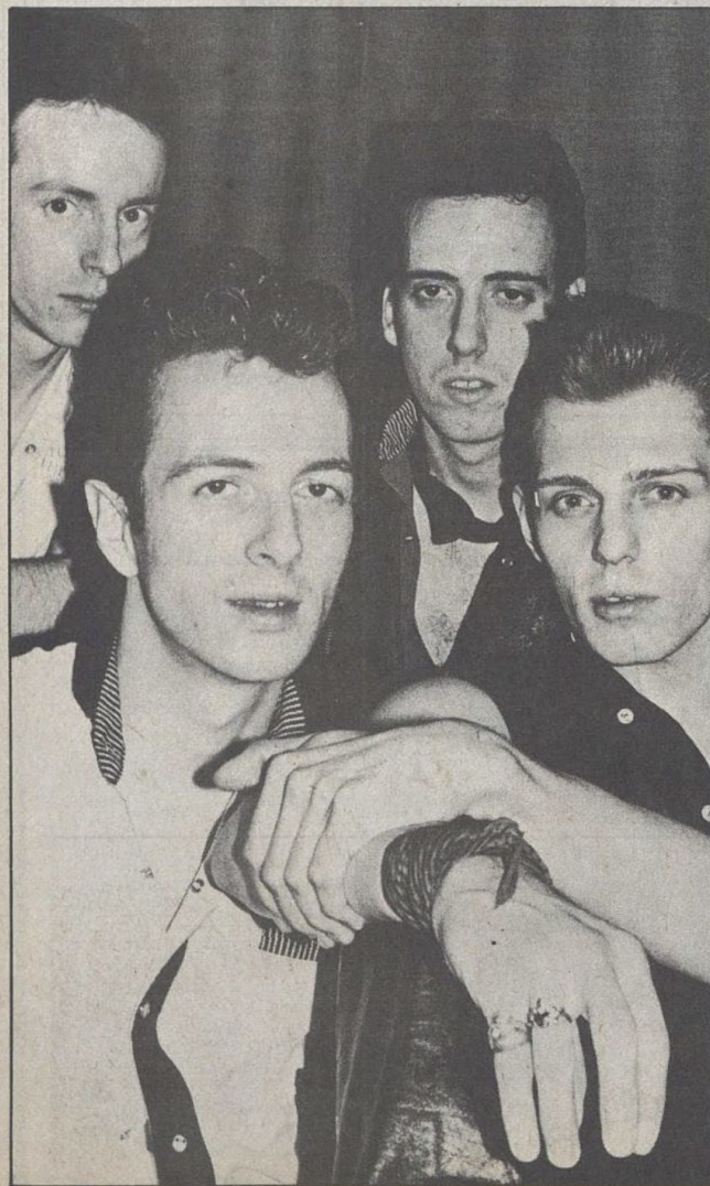
Clash portrait 80: Topper Headon, Mick Jones, Paul Simonon, and Joe Strummer clockwise from top left.