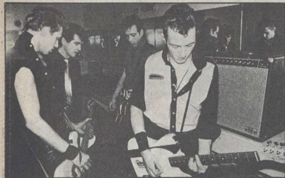
Backstage everyone tunes up before the show starts.