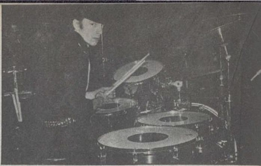
Topper tunes the skins before the Palladium show at soundcheck.