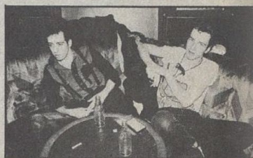
Mick and Joe relax on the Clash tour bus as they speed through the night to the next city.