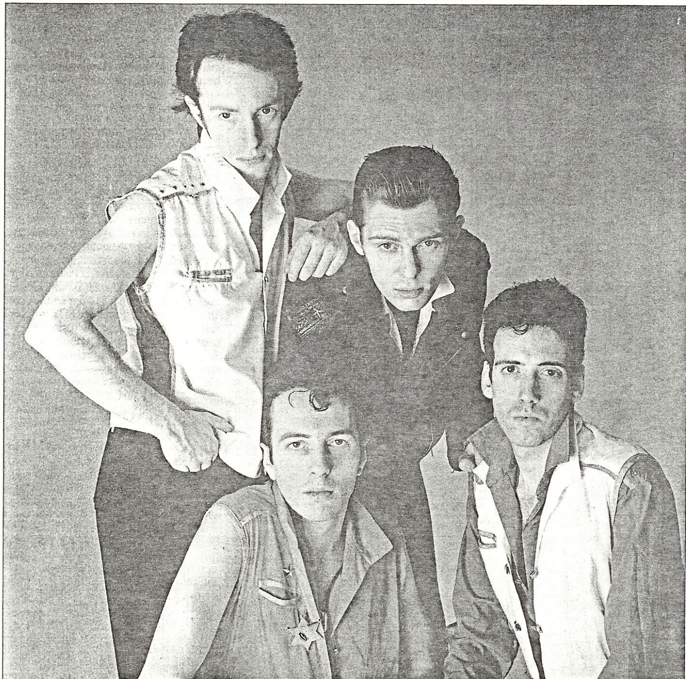
The Clash have finally set themselves free of punk's trivial orthodoxies.

blocks looking for a home, But I run through the empty stone because I'm all alone.