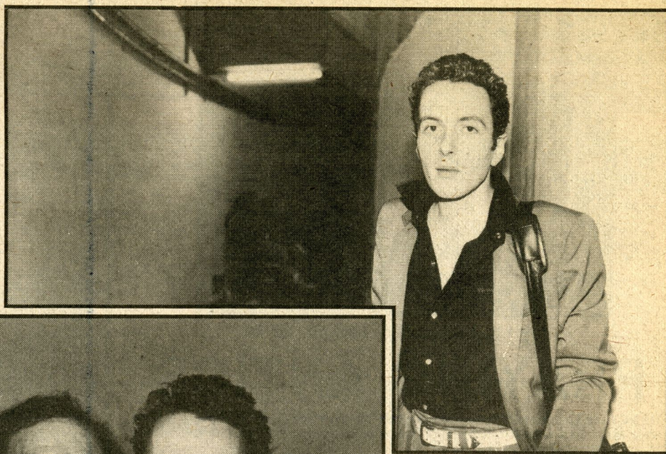
Joe Strummer earns extra cash as a travel courier.

Clash manager Bernie Rhodes whose re-appointment to his past position has been the most important development in the group's recent history. To recap a little, Rhodes took the group under his wing soon after his mate McLaren put together the Pistols and was responsible for The Clash's original urban guerilla stance.