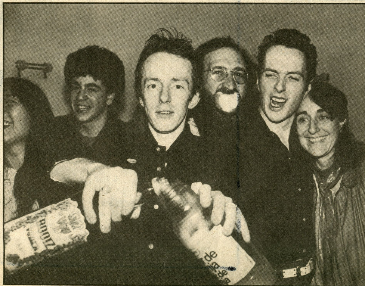
Topper mixes a Molotov Cocktail while an apple explodes in his friends face.

A typical breakdown of communication between themselves and CBS means they aren't anticipating my arrival. This entails several hours of sleuth-work trying to track them down at hotel, gig and first Press conference, their disdain for schedules meaning missing them on each occasion. Getting into