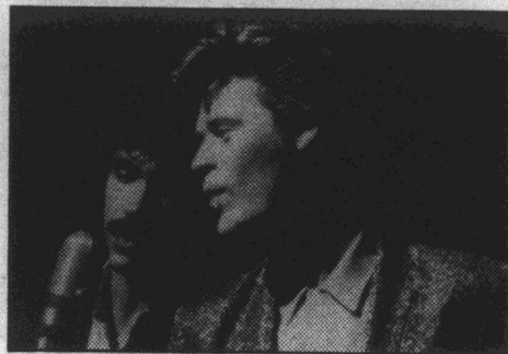
Daryl Hall (r) and John Oates