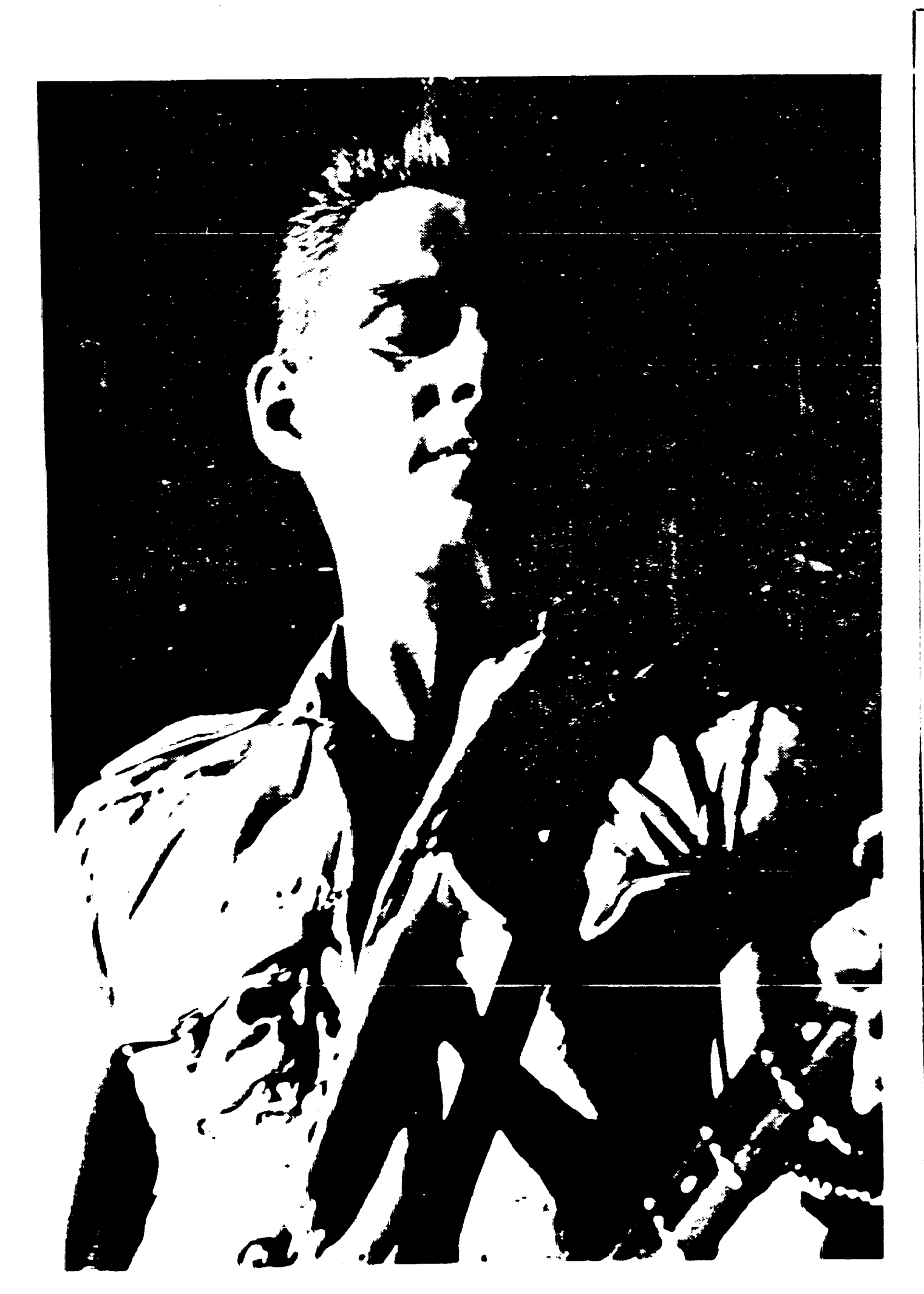
Easter Sunday Rock and Roll - www. - as a cross to the contract of the contract of the contract of the contract of the contract of the contract of the contract of the contract of the contract of the contract of the contract of the contract of the contract of the contract of the contract of the contract of the contract of the contract of the contract of the contract of the contract of the contract of the contract of the contract of the contract of the contract of the contract of the contract of the contract of the contract of the contract of the contract of the contract of the contract of the contract of the contract of the contract of the contract of the contract of the contract of the contract of the contract of the contract of the contract of the contract of the contract of the contract of the contract of the contract of the contract of the contract of the contract of the contract of the contract of the contract of the contract of the contract of the contract of the contract of the contract of the contract of the contract of the contract of the contract of the contract of the contract of the contract of the contract of the contract of the contract of the contract of the contract of the contract of the contract of the contract of the contract of the contract of the contract of the contract of the contract of the contract of the contract of the contract of the contract of the contract of the contract of the contract of the contract of the contract of the contract of the contract of the contract of the contract of the contract of the contract of the contract of the contract of the contract of the contract of the contract of the contract of the contract of the contract of the contract of the contract of the contract of the contract of the contract of the contract of the contract of the contract of the contract of the contract of the contract of the contract of the contract of the contract of the contract of the contract of the contract of the contract of the contract of the contract of the contract of the contrac Paul S memore, one of the two original members still with The Clash who appeared in Laker Hall Sunday

With peace of mind restored, he prepare to go to sleep. Forgetting to brush his teeth he crawle iron bed He takes from his night table a note pad and nen and writes " .call Mom and ask her to send more Vailium."