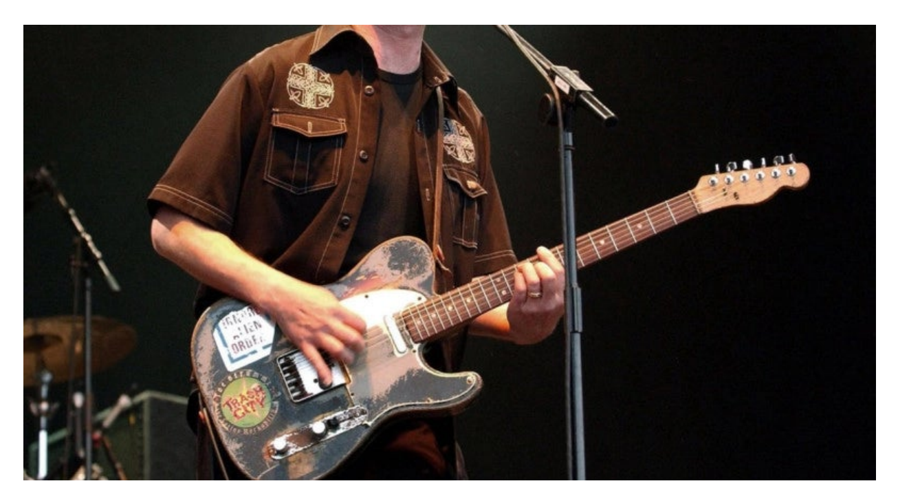
The Clash singer Joe Strummer pictured during his solo career.

The band visited the city as part of a low key nationwide busking tour in 1985 and performed in Gollum's, a basement bar at the Mowbray Hotel, and at the Drum Club night club, in the Mayfair Suite, in Newcastle Road.