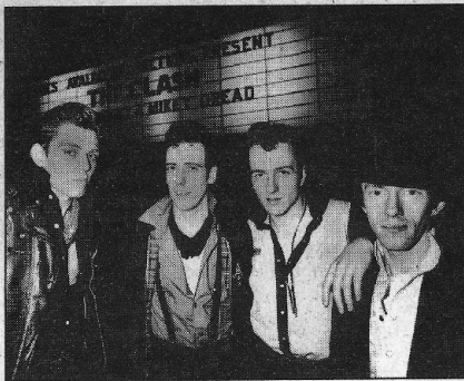
PAUL SIMONON, MICK JONES, JOE STRUMMER AND TOPPER HEADON

A little more than an hour later, the front two rows of